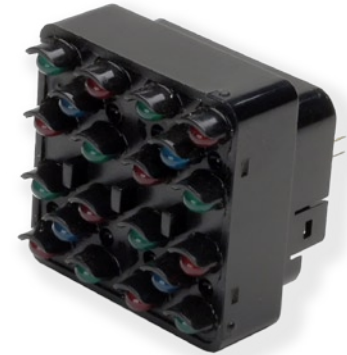
*2040-5LED Mega Hybrid Unit shown